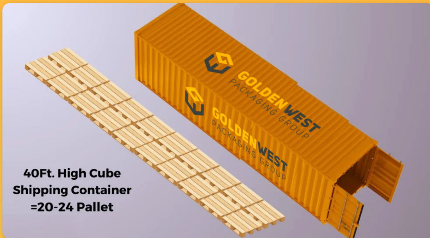
40Ft. High Cube Shipping Container =20-24 Pallet